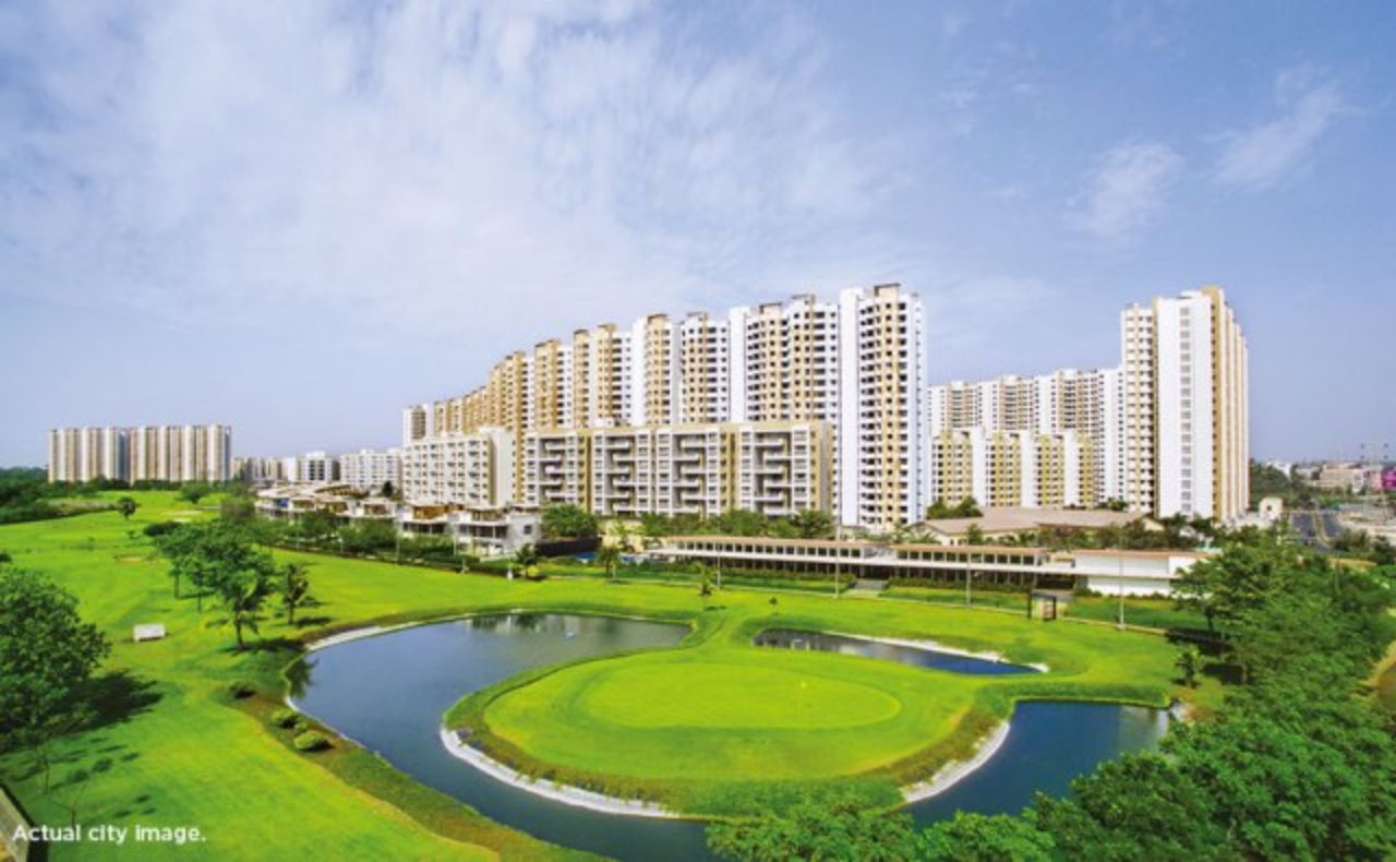
Actual city image.